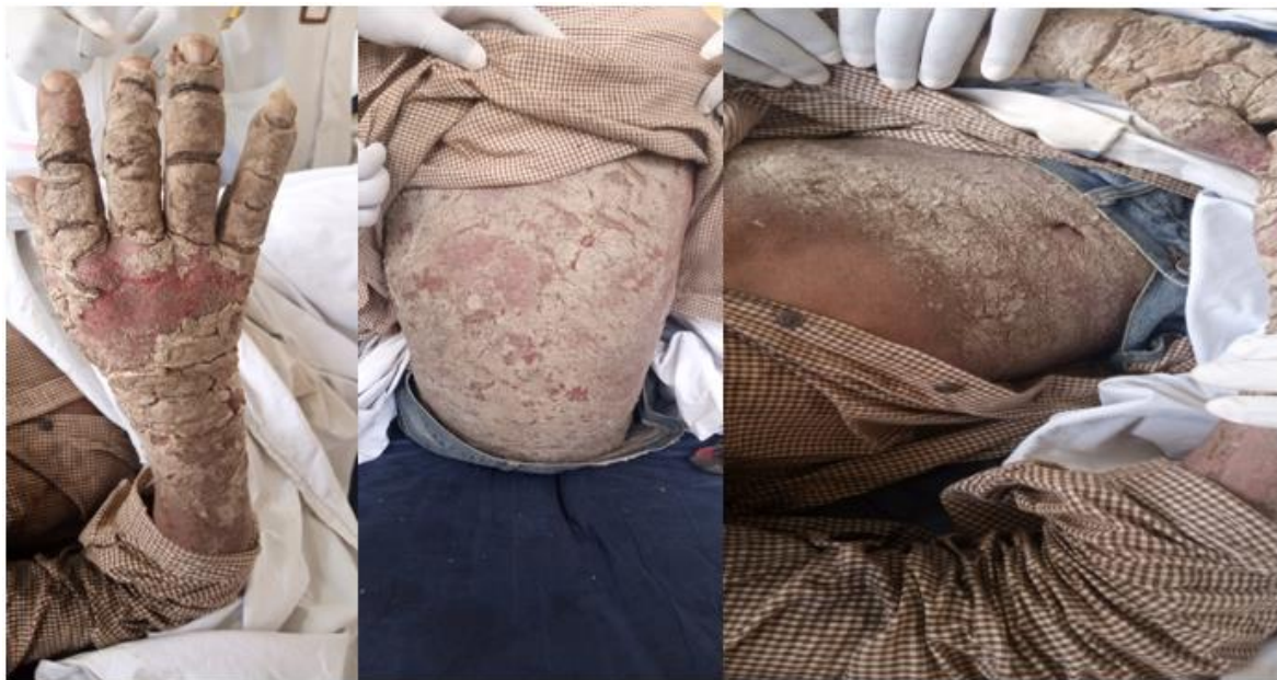
Figure 1. Thick, hyperkeratotic and crusting lesions distributed extensively over the limbs, abdomen and back in 33-year-old man with poorly controlled HIV infection before treatment

treated with oral ivermectin 12mg on day one and repeated on day 7 and 14 together with lindane lotion 1% applied at night on day 1, 7 and 14. He carried out daily soaking with 0.1% of potassium permanganate bath to treat the local bacterial infection and application of vaseline petroleum jelly since he could not get salicylic acid ointment to remove the scales. He was discharged on day 18 th in very good condition (Figure 3) after sessions of adherence counselling and was restarted on ARVs, a combination of Dolutegravir, Lamivudine and Tenofovir disoproxil fumarate.