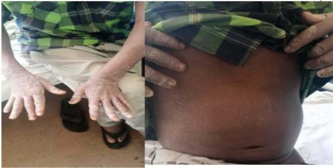
Figure 3. Patient with crusted scabies 18 days after initiation of treatment